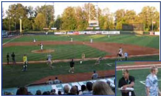
The new PK Park next to Autzen Stadium; right is Soldier winning a pizza for her group.

Next we supported Lane County Republicans (LCR) and their EMS Night for our soldiers . LCR was able to invite and sponsor all the military personnel who wanted to come because of the generous support of all of you Republicans out there. Here are a few photos: